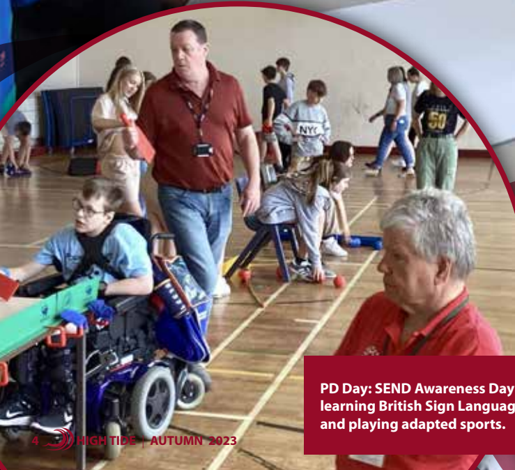
PD Day: SEND Awareness Day: learning British Sign Language and playing adapted sports.