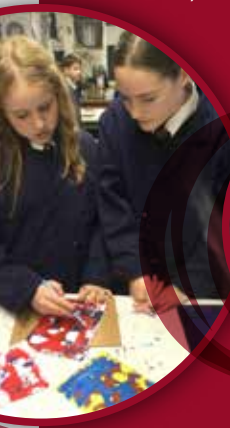
Y7 stencil making and Gelli printing

In November, Year 7 students spend the first PD day of the year 'Celebrating the Creative Arts', making stencils and Gelli printing, designing and launching rockets, cooking Croque Monsieurs, and composing.