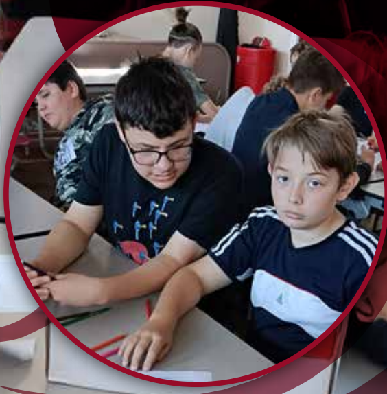
PD Day: Dragons' Den: design, make and 'sell' your t-shirt to a panel of 'Dragons'.

Here is a collection of photos to give you just a taste of some of what was on offer.